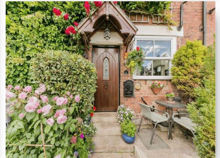
Teanhurst Road, Tean, Stoke-On-Trent. ST10 4LR