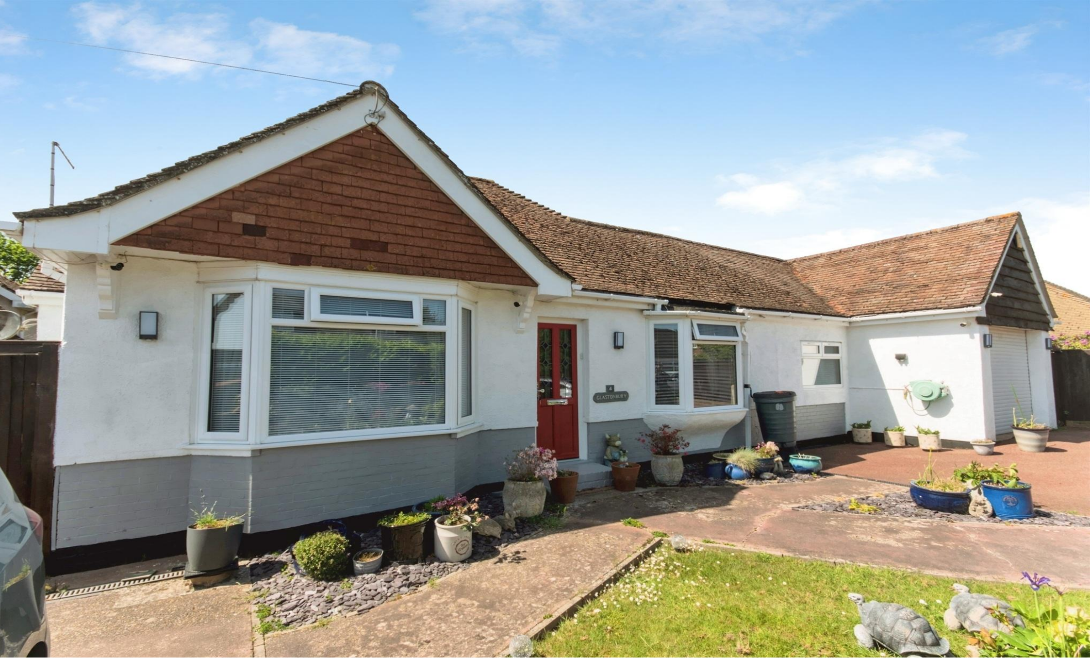
Thorne Crescent, Bexhill-On-Sea TN39 5JH