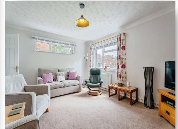
Combs Green, Combs, Stowmarket, IP14 2NP