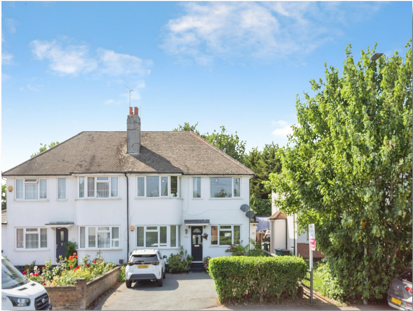
Courtlands Drive, Watford, WD17 4HY