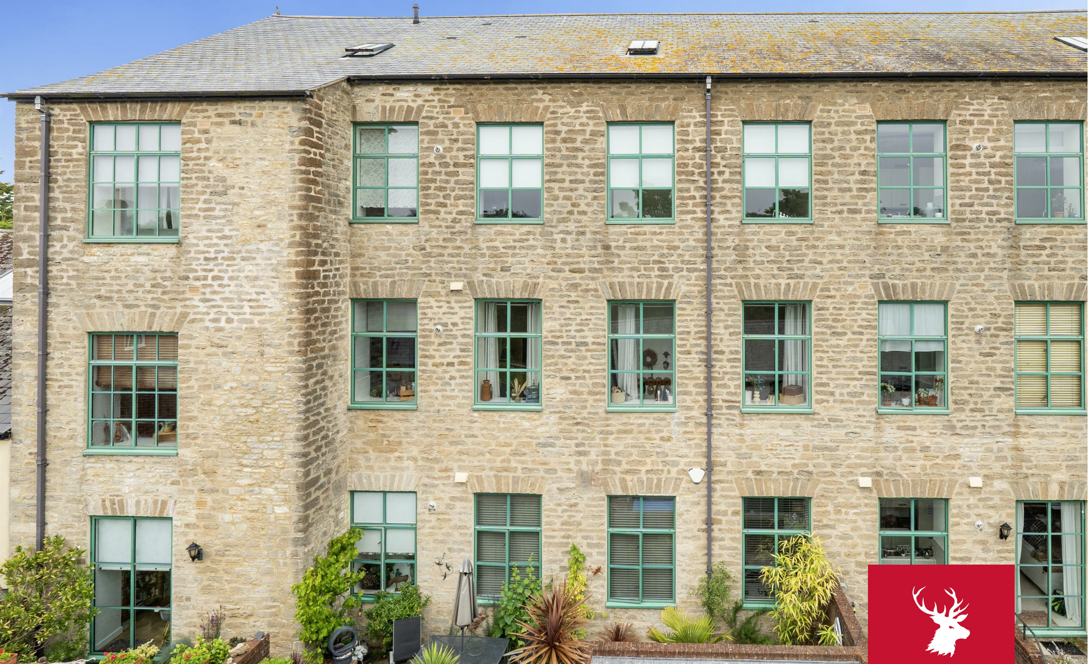
Flat 8, Priory Mills