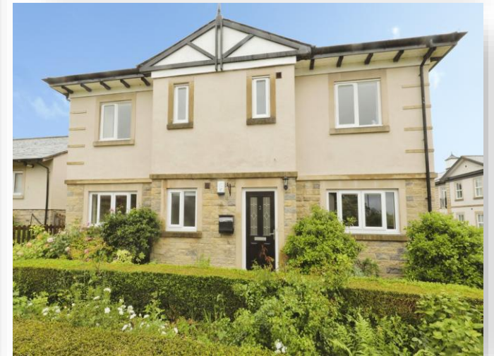
Garden Court, Killinghall Harrogate HG3 2GN