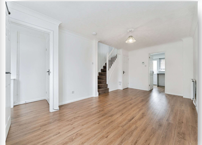
Swanton Close, March PE15 8SS