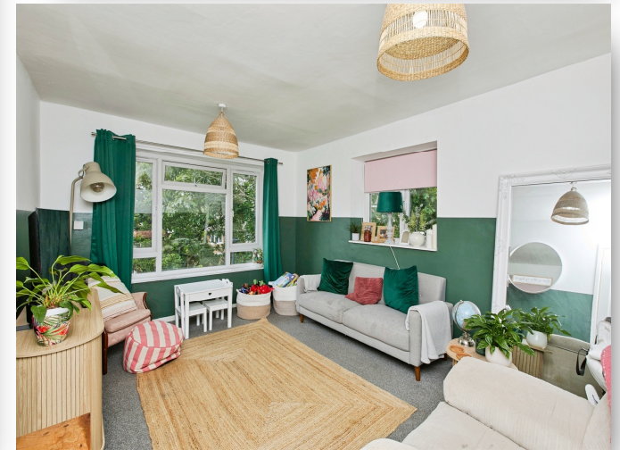
William Street, Derby DE1 3LW