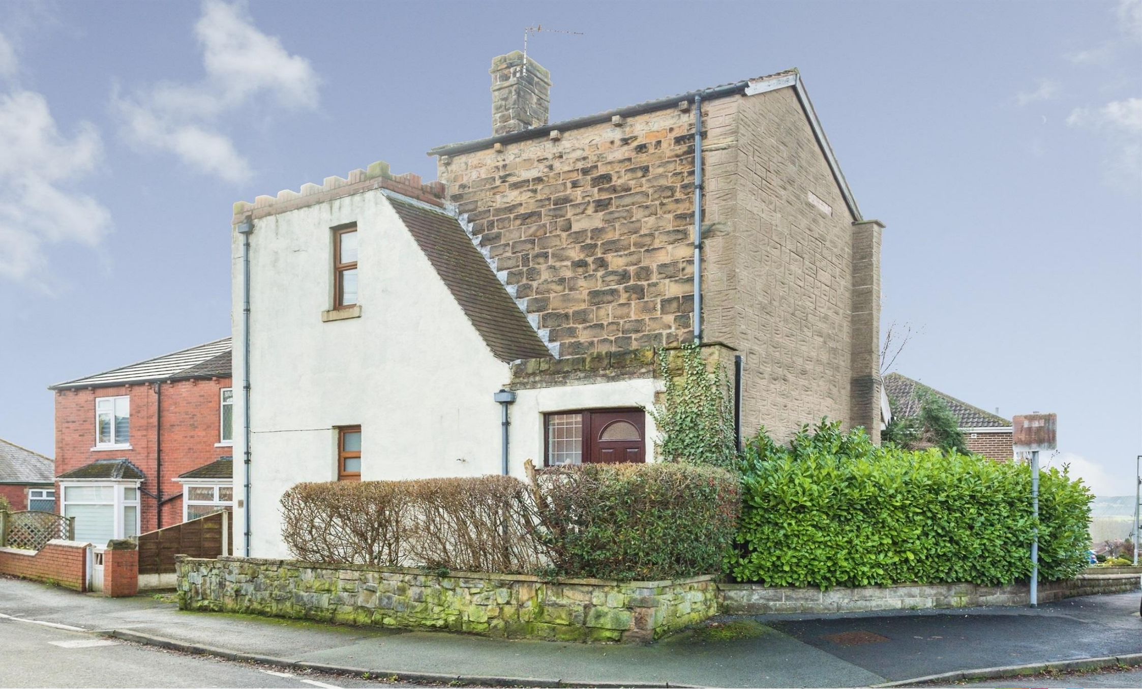
Peel Street, Horbury Wakefield WF4 5AT