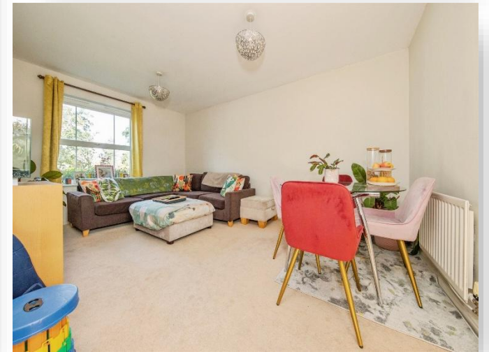
Valentinus Crescent, Colchester CO2 7QG