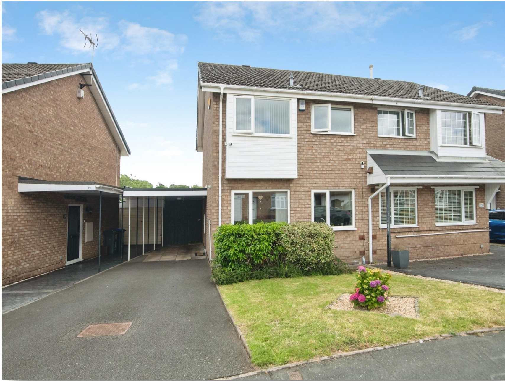
Amberley Green, Birmingham B43 5TJ