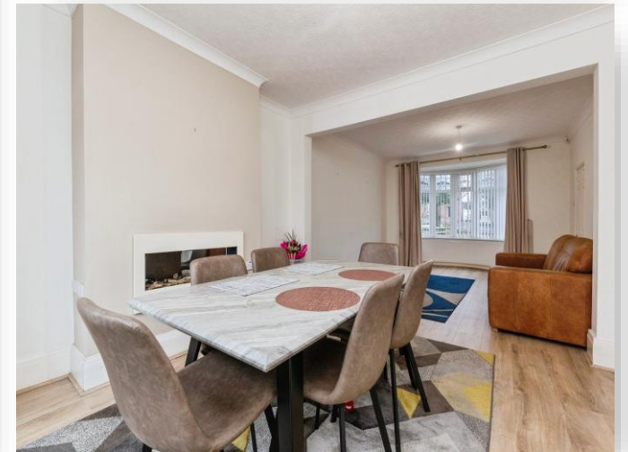
Conifer Grove, Billingham TS23 1PG