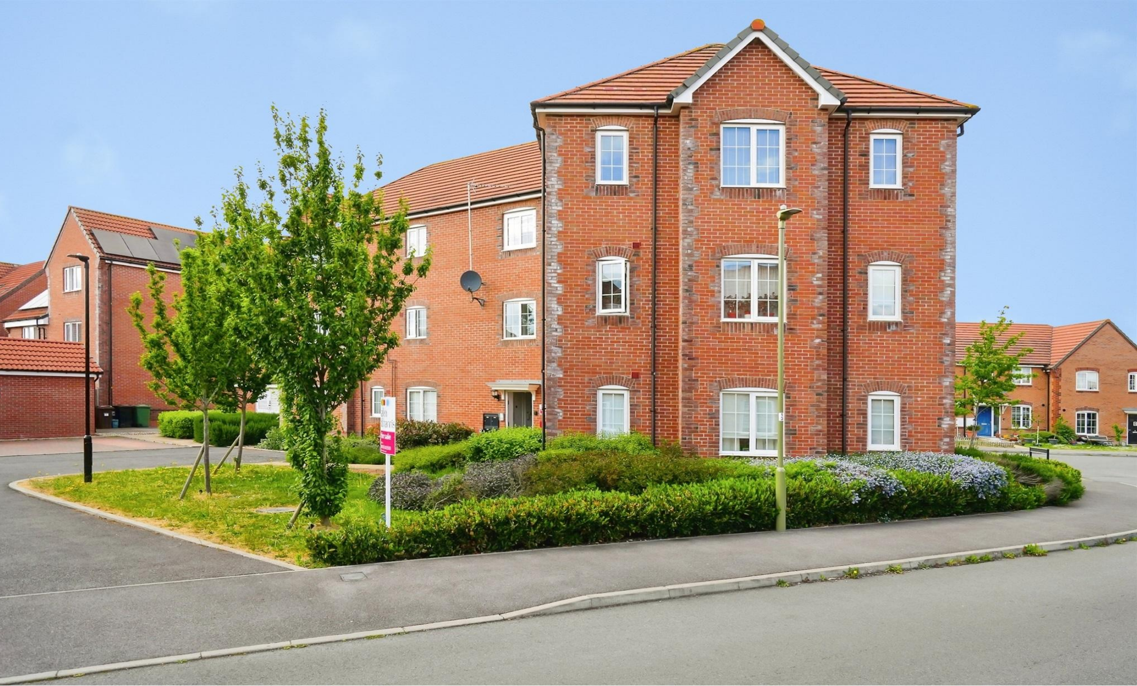
Falcon Drive, Didcot, OX11 6HT