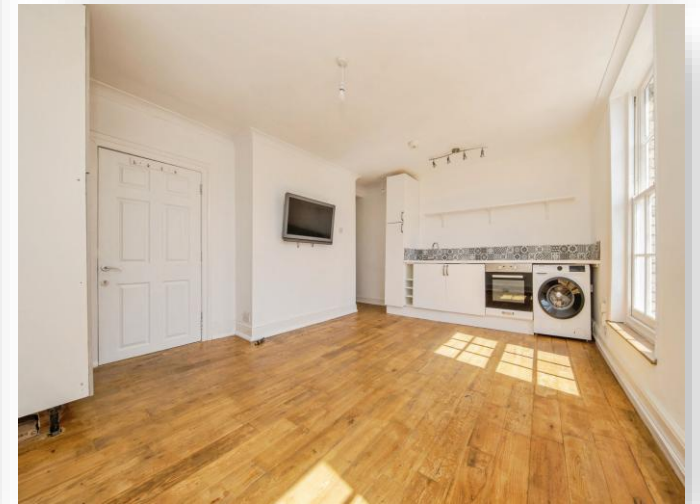
St. Georges Street, Ipswich, IP1 3NF