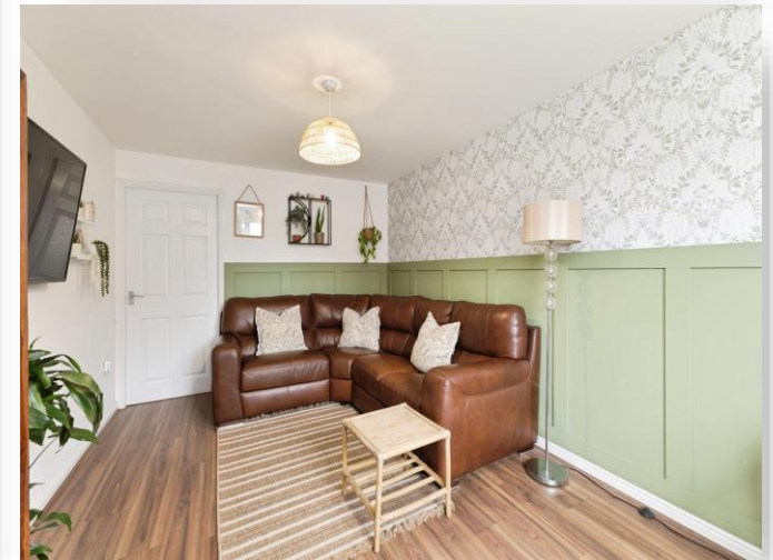
Keld House Gardens, Middlesbrough TS3 9EY