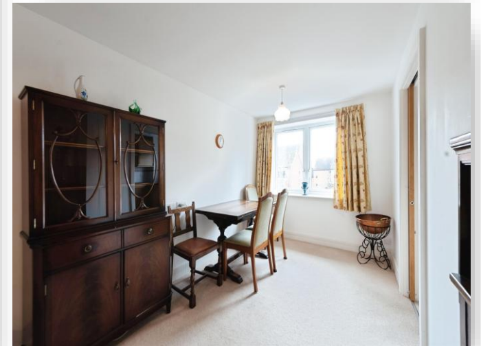
Victory Court, Beaconsfield Road, Waterlooville PO7 7FB