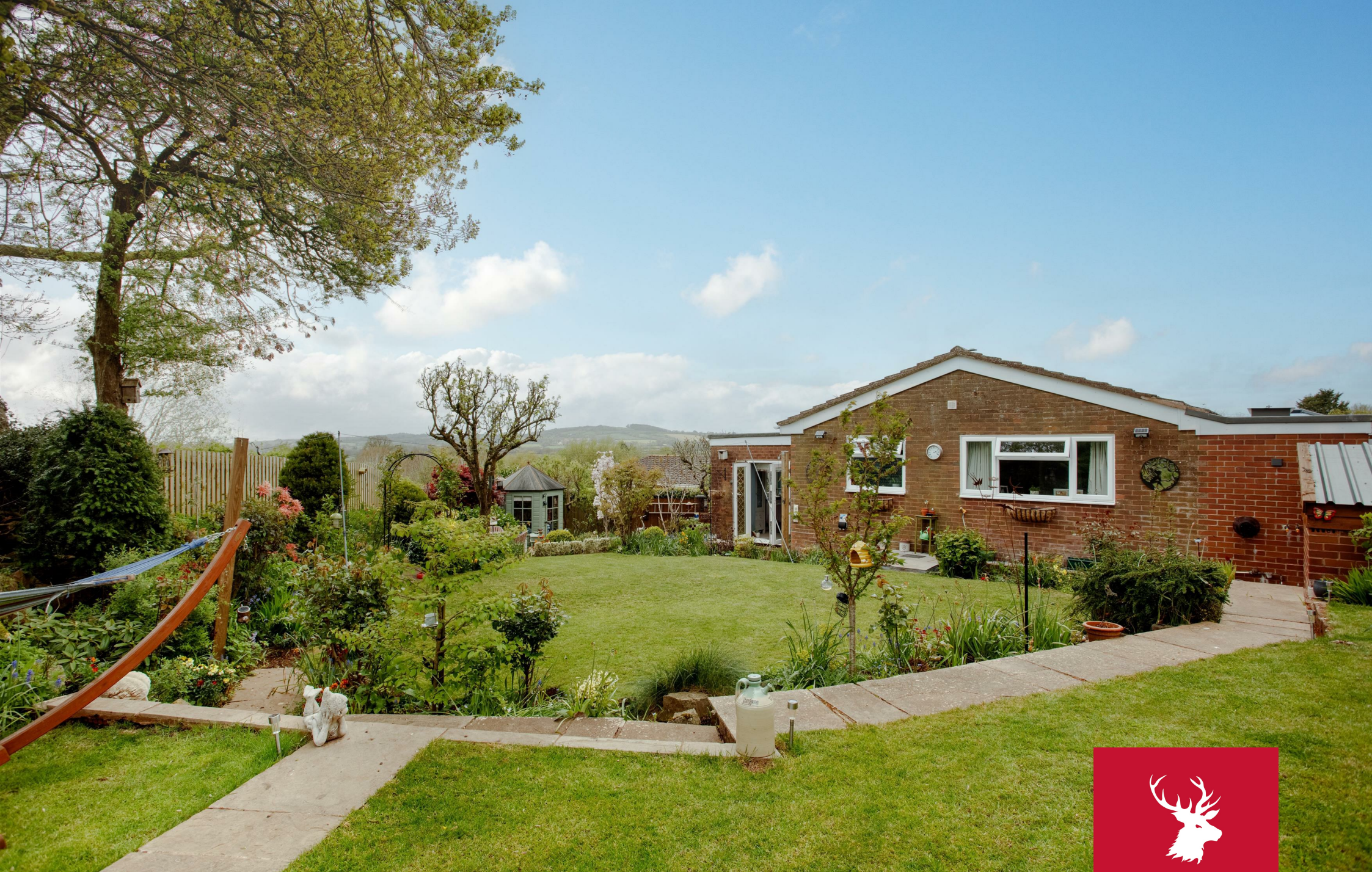
5 Tyes Orchard