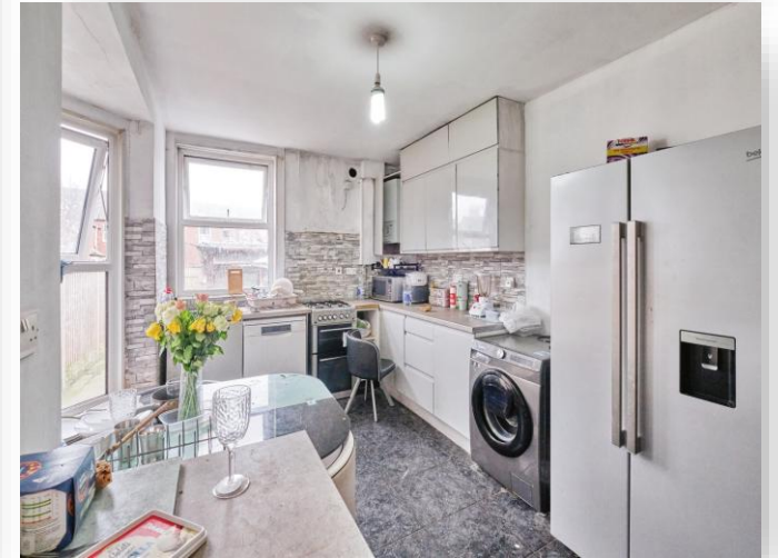
Eastwood Road, Balsall Heath Birmingham B12 9NB