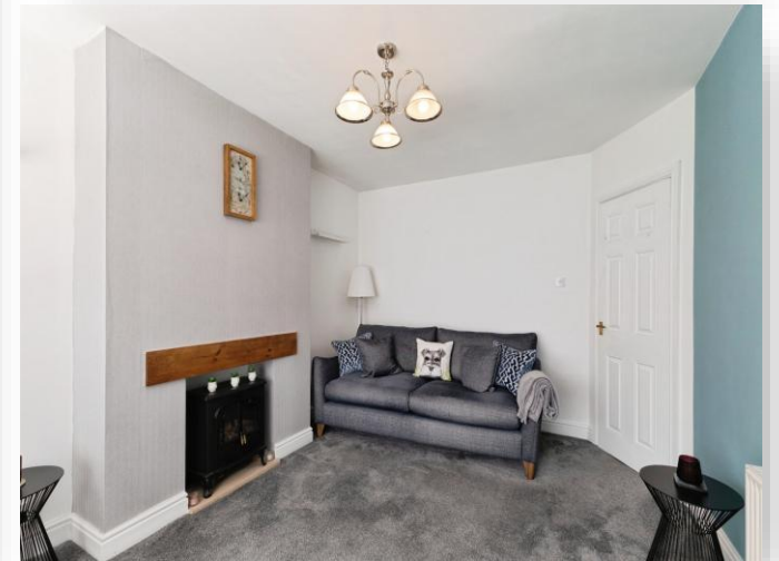
Farndale Road, Nunthorpe Middlesbrough TS7 0HG