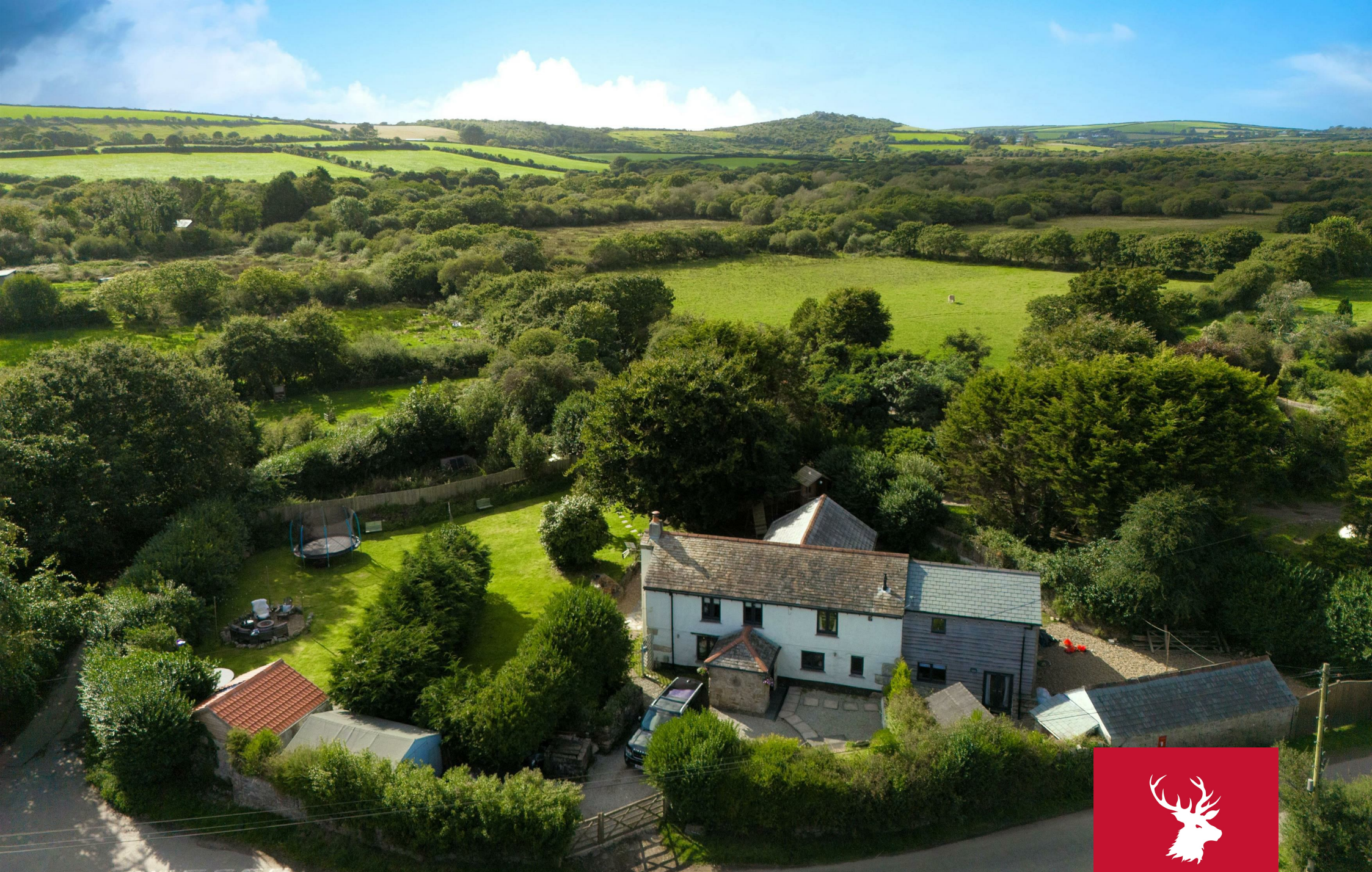
Beech Tree Cottage