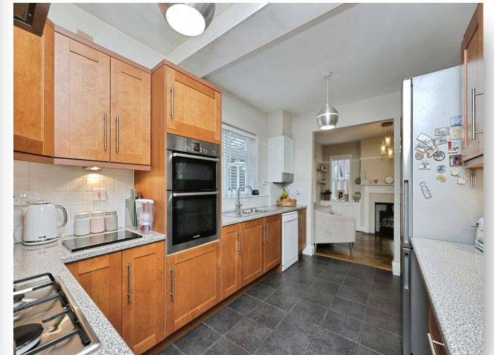
Westdene, Park Road, Dereham, NR19 2BT