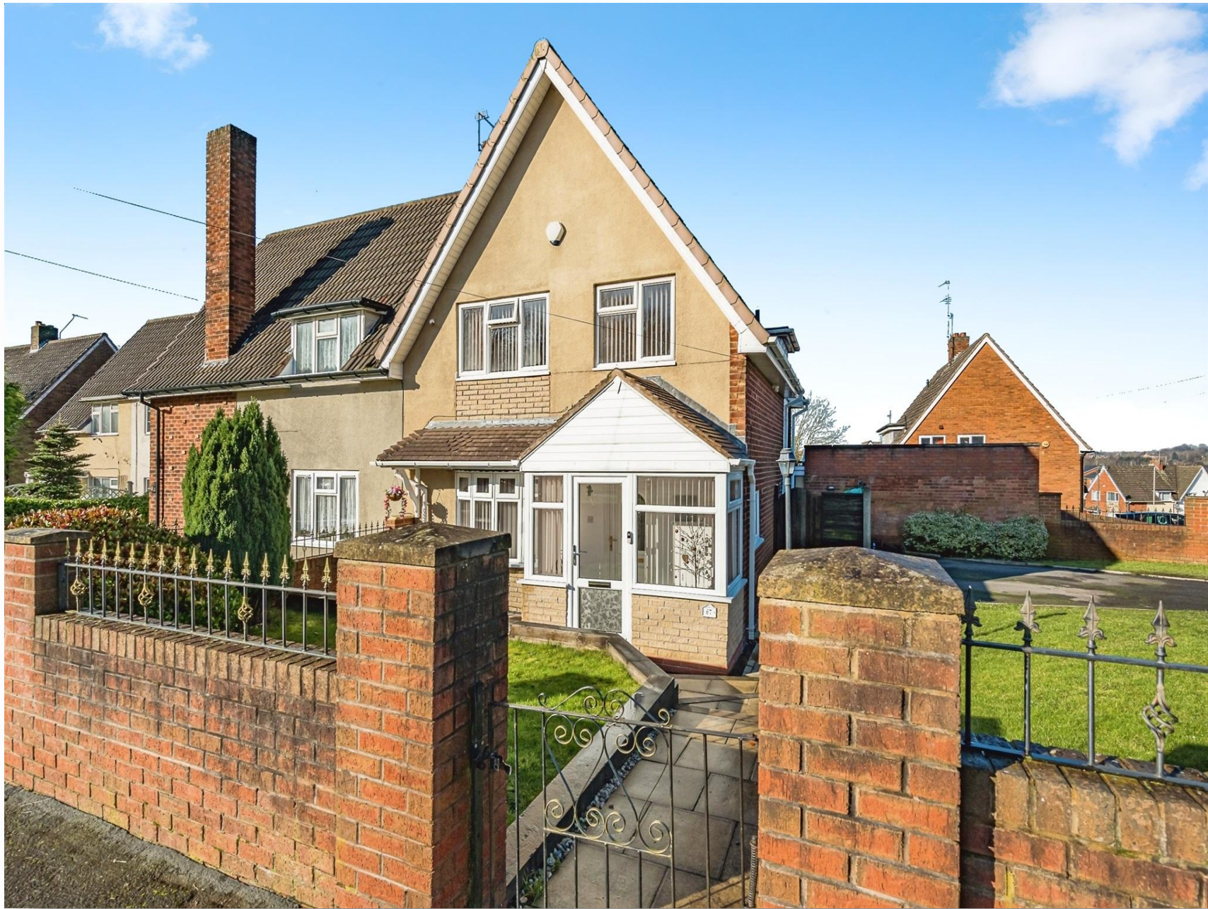
Ashenhurst Road, Dudley DY1 2HN