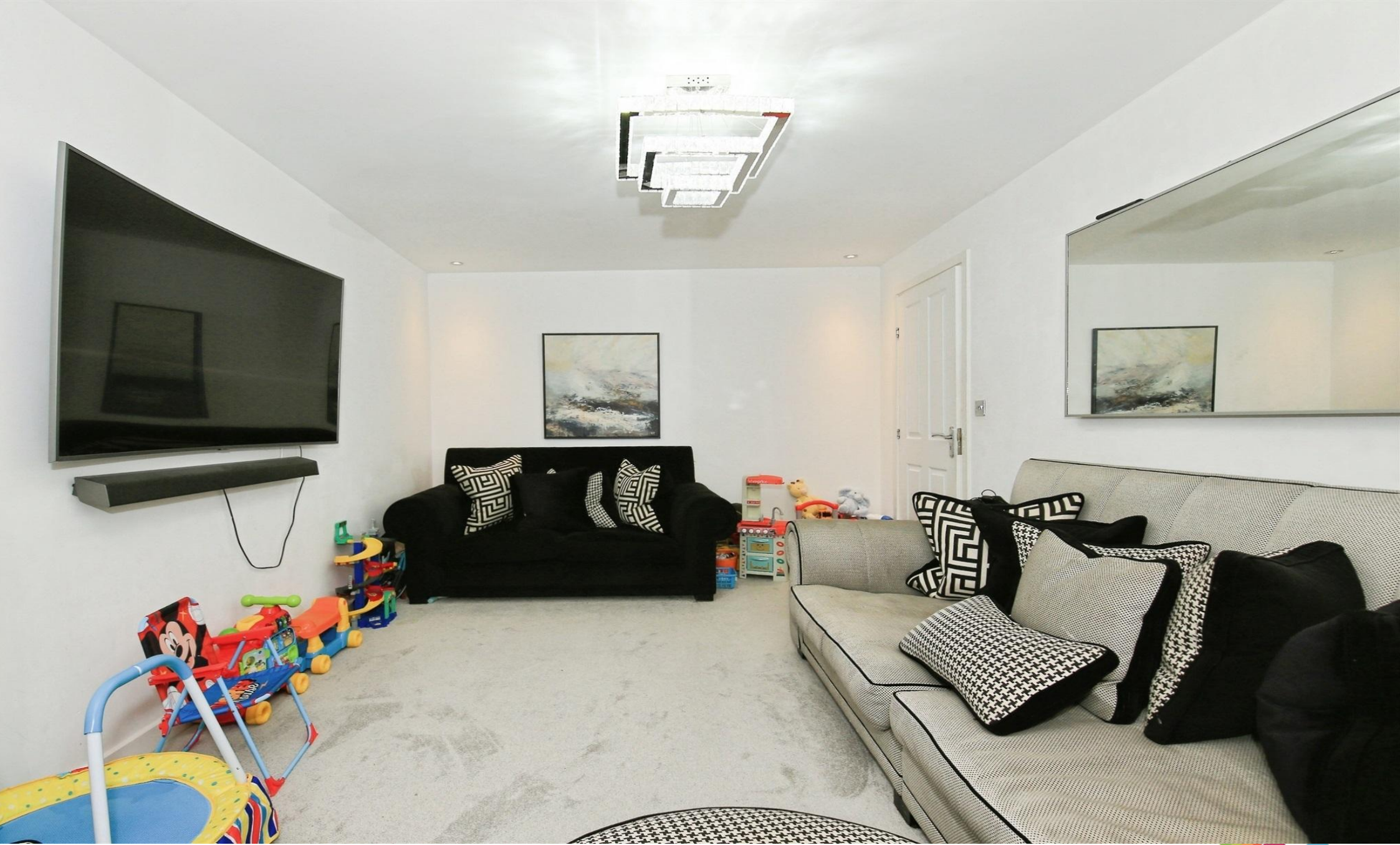
Brodie Place, Hampton Gardens, Peterborough, PE7 8QD