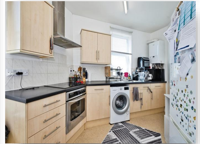
Crofton Avenue, Yeovil, BA21 4DL