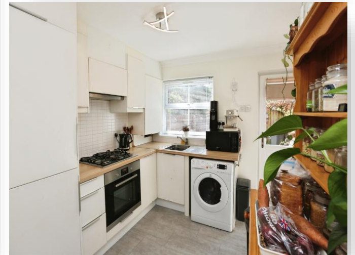
School Place, Seaward Road, Southampton SO19 2HA