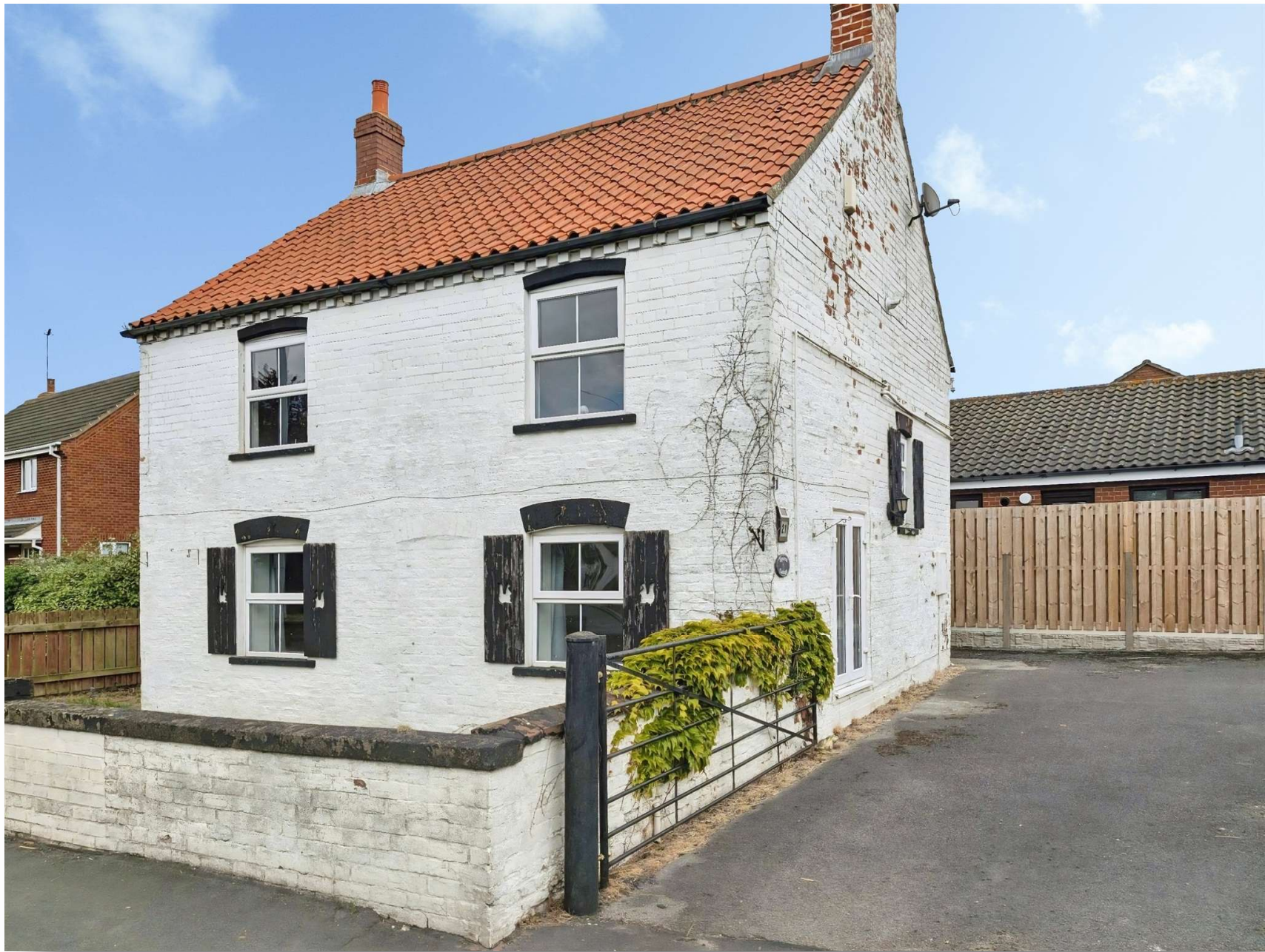
Main Street, Leconfield Beverley HU17 7NQ