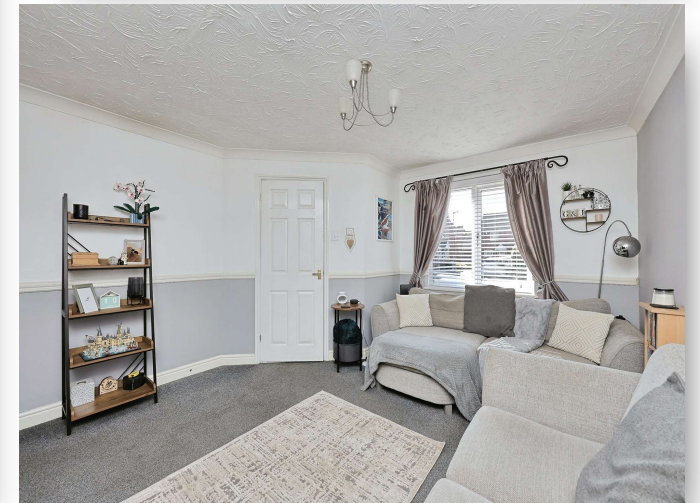
Red Admiral Close, Wymondham NR18 0XW