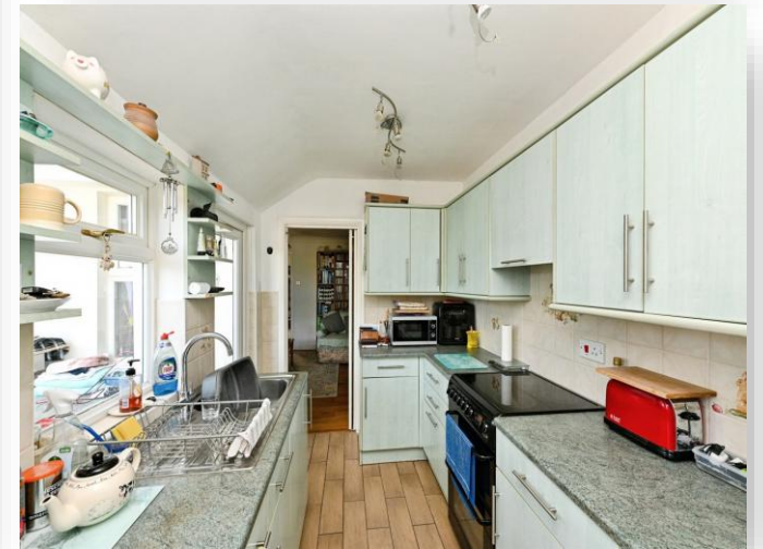
Shepherdsgate Road, Tilney All Saints, King's Lynn, PE34 4RP