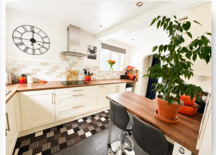
Hinkler Road, Southampton SO19 6DH