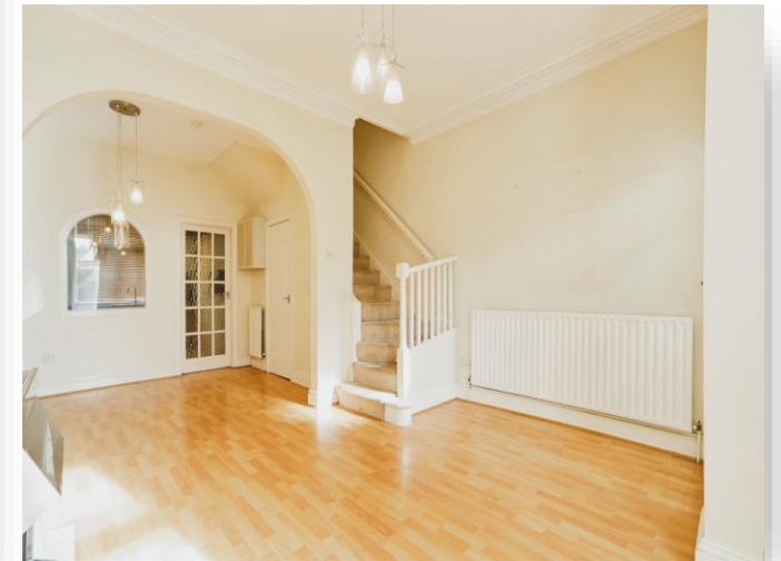
Alexandra Road, Shipley BD18 3ER