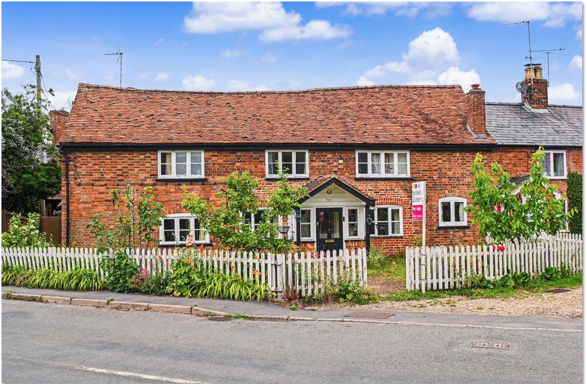
Station Road, Long Marston Tring HP23 4QS