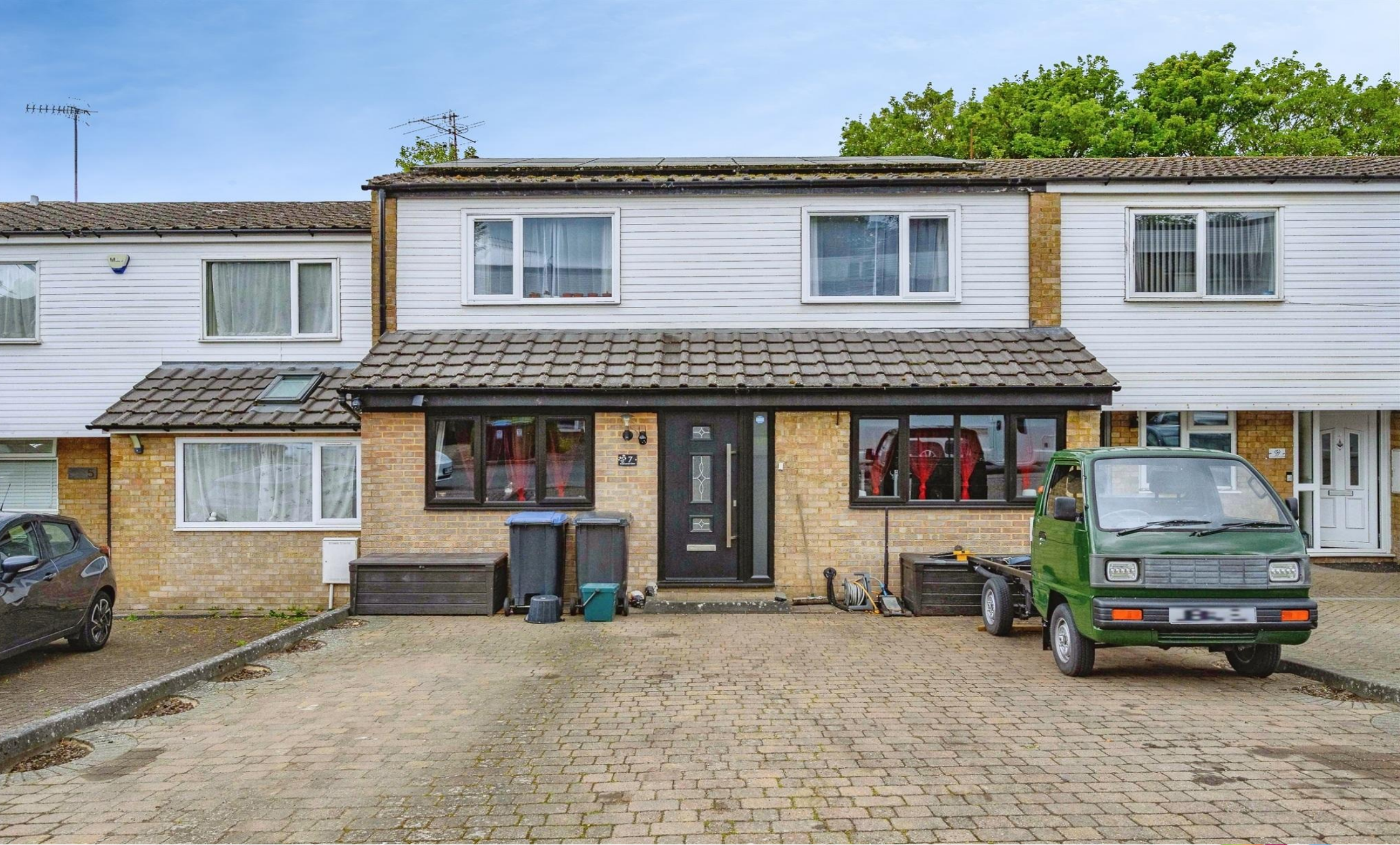
Caernarvon Close, Hemel Hempstead HP2 4AN