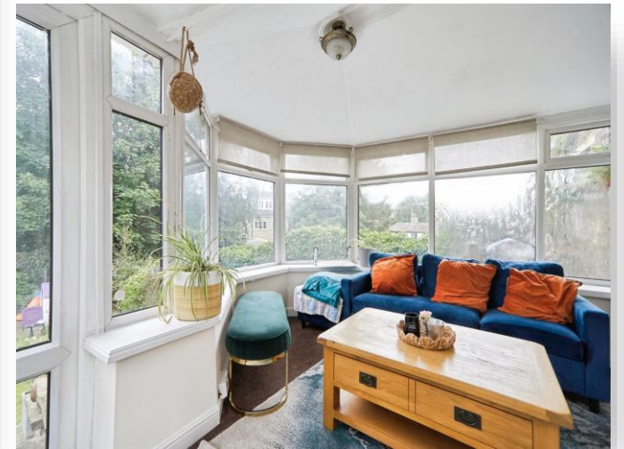
Haworth Road, Allerton Bradford BD15 9LL