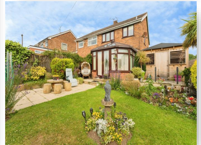
Pleasington Close, Prenton, CH43 9HN