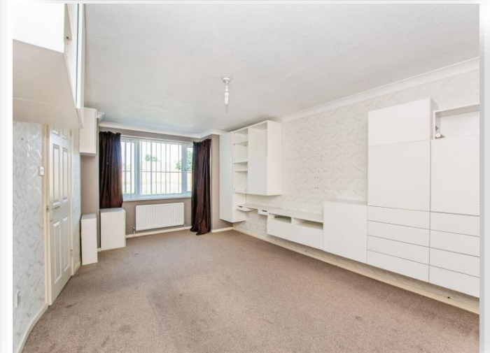
57c South Brink, WISBECH PE14 0RQ