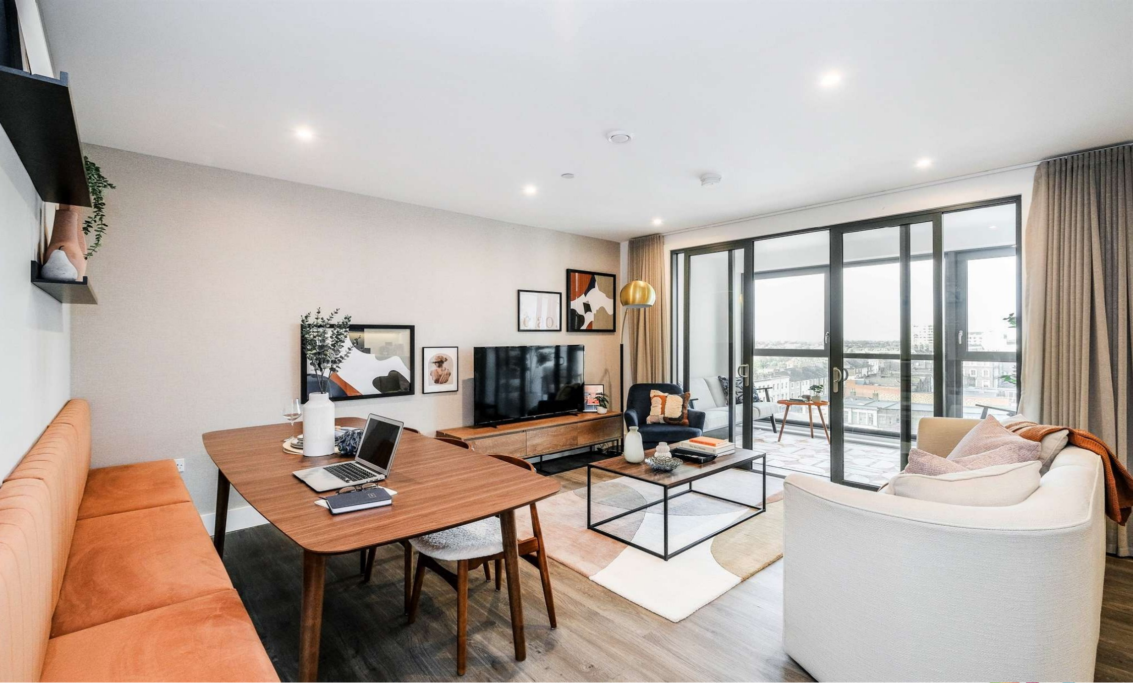
Angel Heights Poplar Walk, Croydon CR0 1LZ