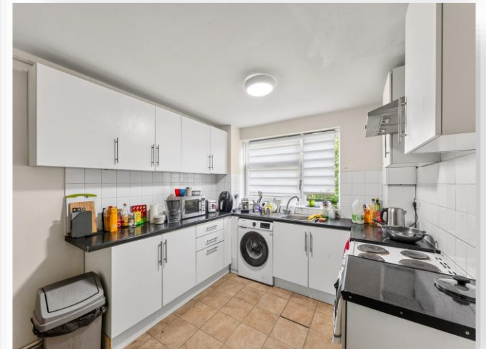
Hanford Close, London, SW18 5AX