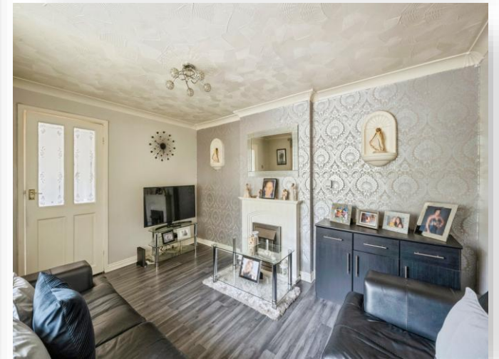
Lime Tree Walk, Denaby Main Doncaster DN12 4TF