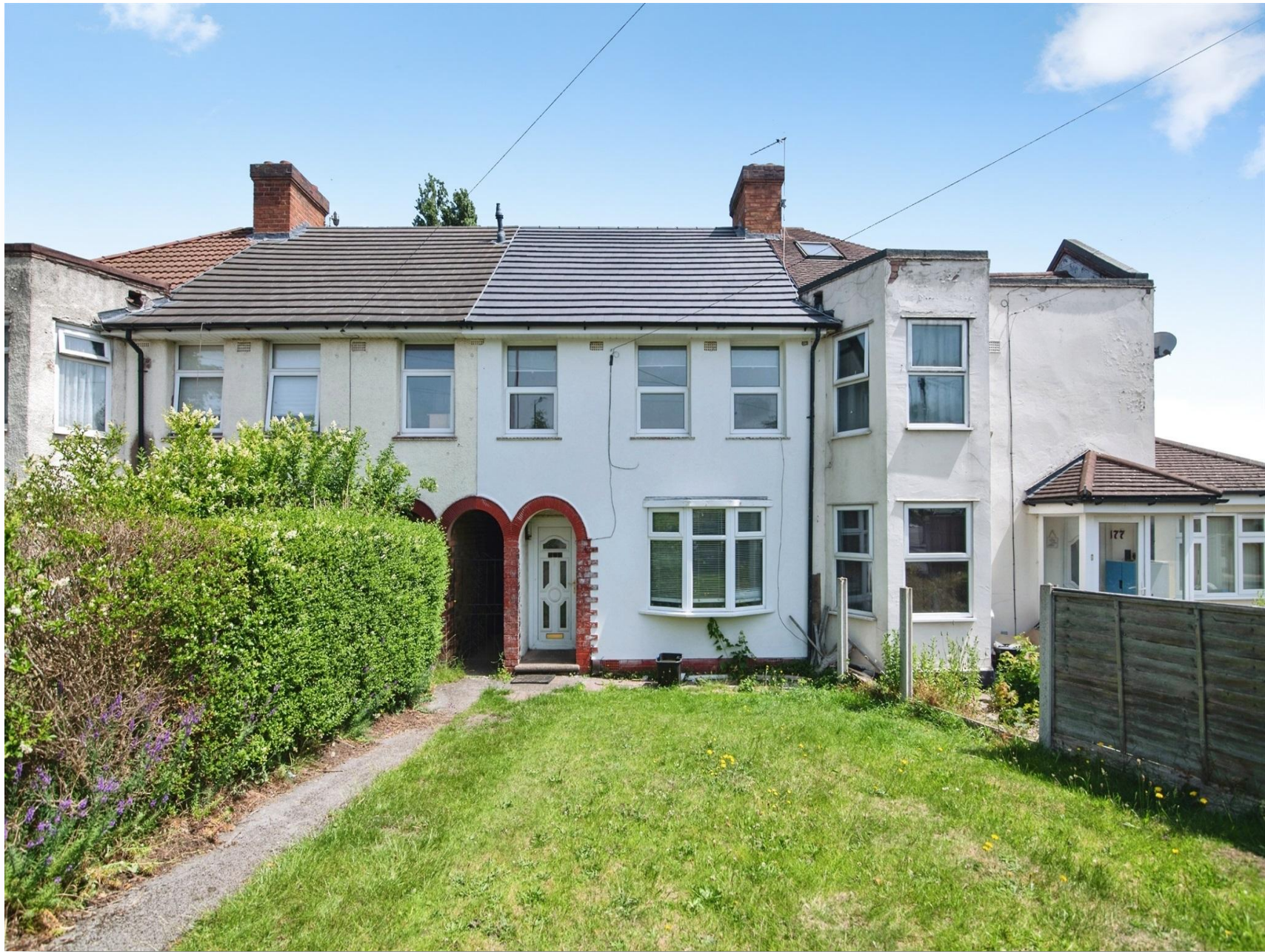
Cranbourne Road, Birmingham B44 0DE