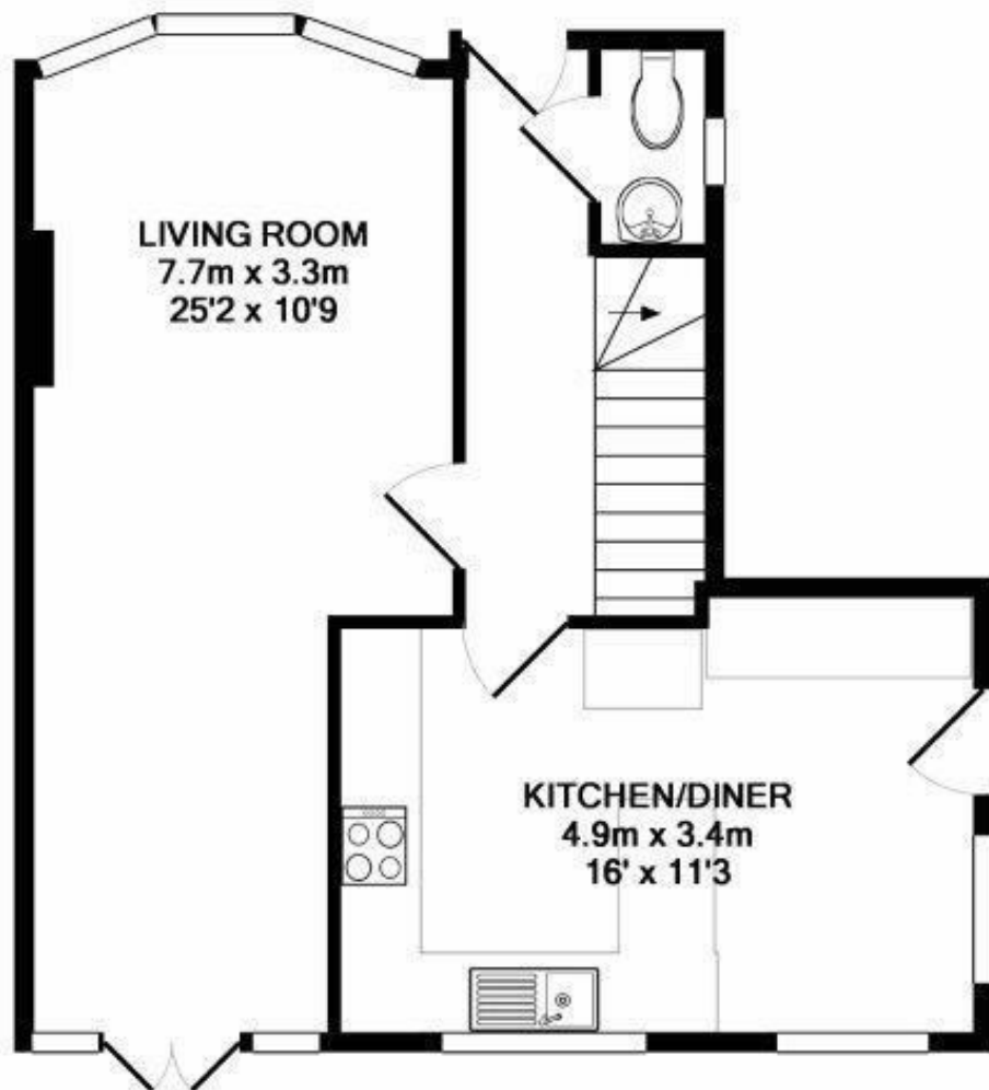
GROUND FLOOR APPROX. FLOOR AREA 45.7 SQ.M. (492 SQ.FT.)