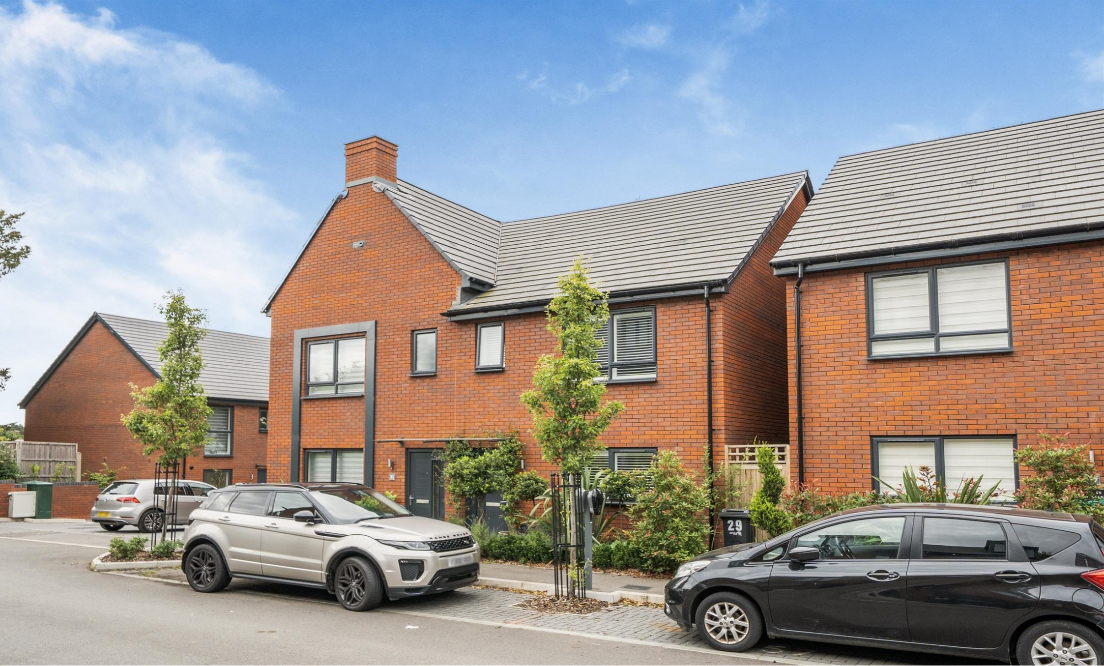
Sika Gardens, Enfield, EN2 8GP