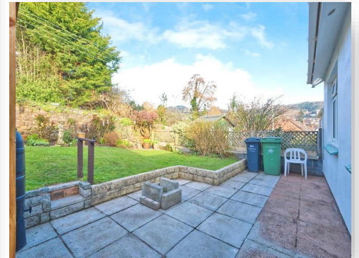
Millbridge Gardens, Minehead, TA24 5XA