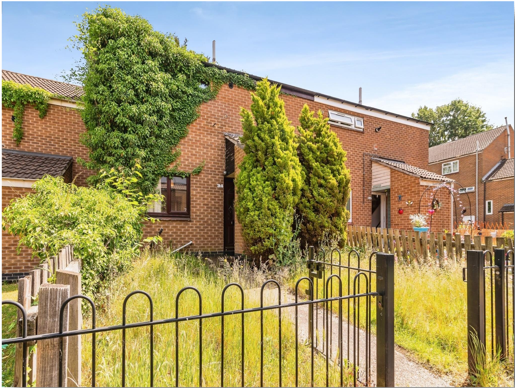
Vincent Gardens, Nottingham NG7 5GA