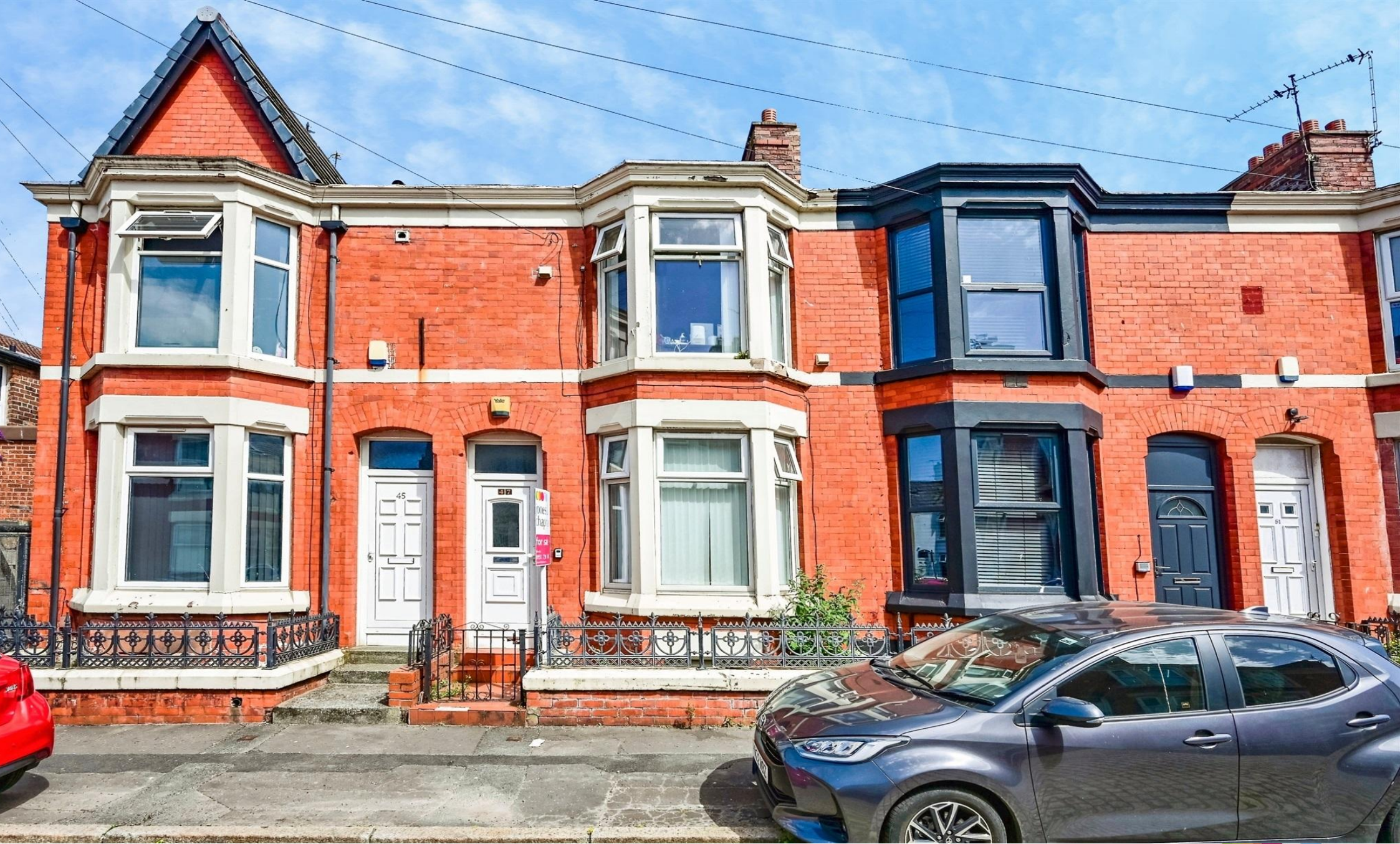
Adelaide Road, Kensington Liverpool L7 8SQ