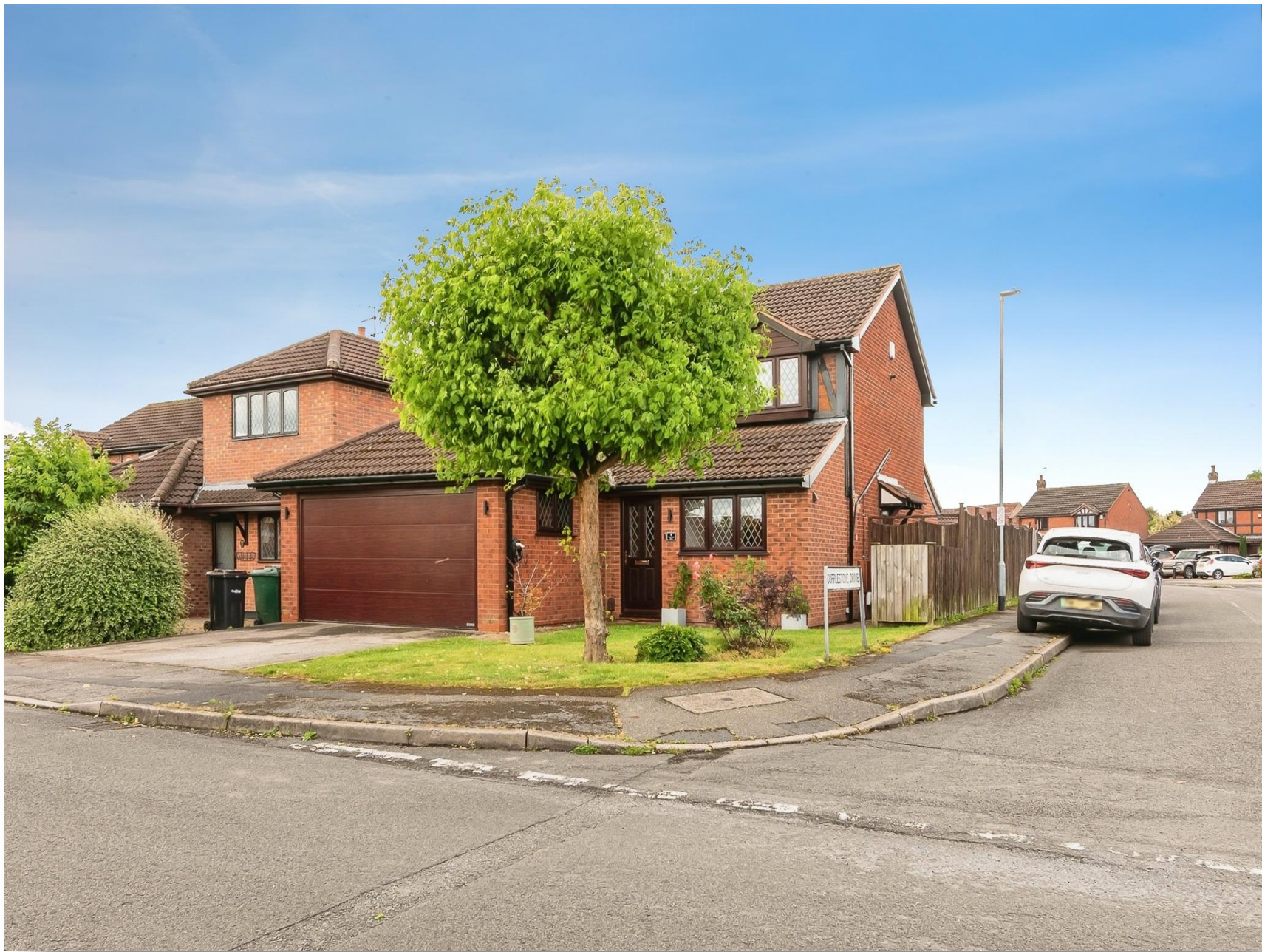
Thurlestone Drive, Nottingham NG3 5SD