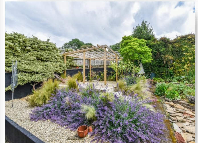
Leys Lane, Frome, BA11 2JS