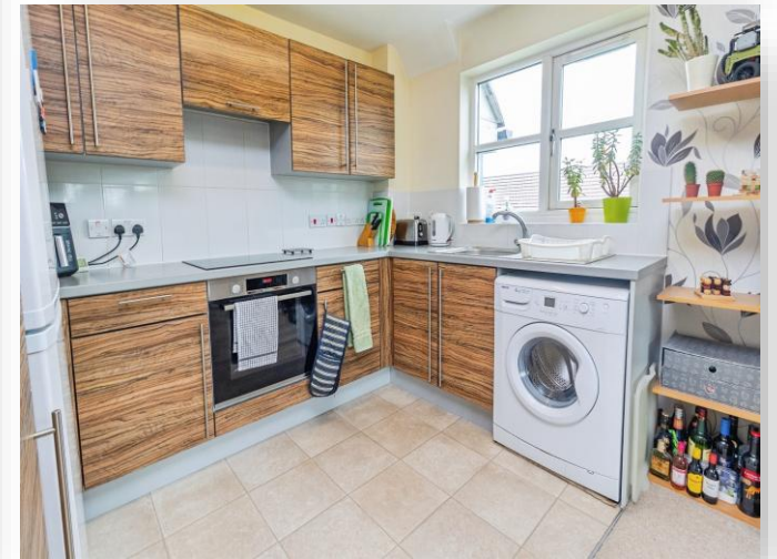
Tyhurst, Middleton, Milton Keynes, MK10 9RP