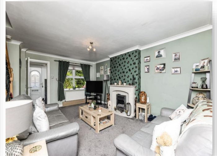
Scarborough Lane, Tingley Wakefield WF3 1BF