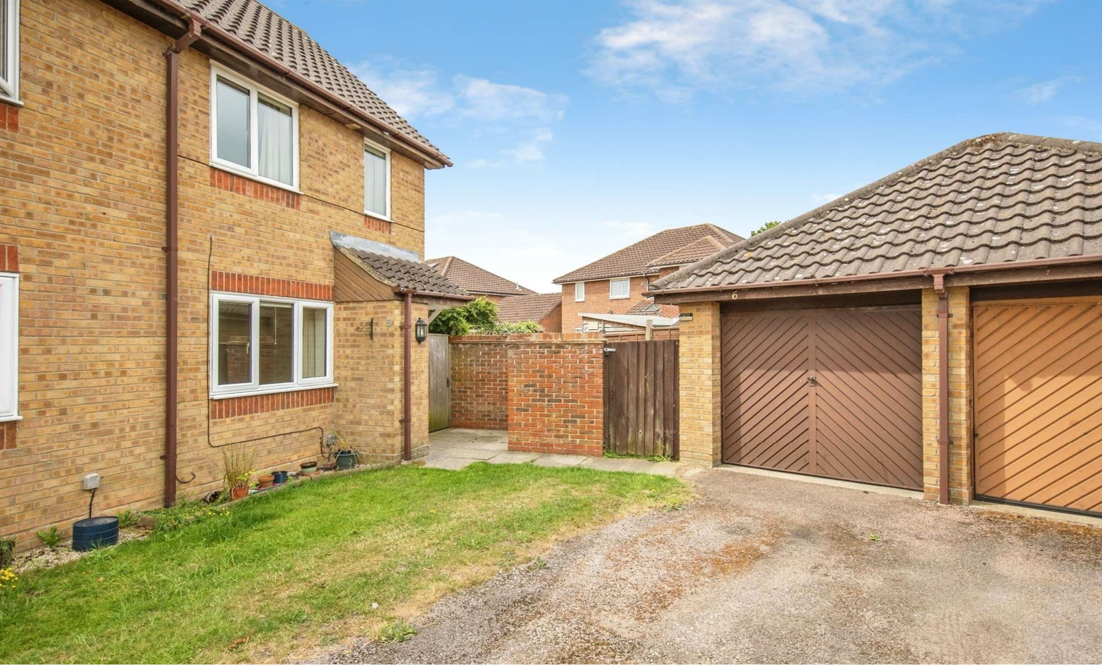
Grassmere, Highwoods, Colchester, CO4 9UG