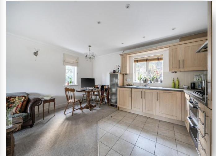
Flat 4 Cygnet House, Boulters Court, Maidenhead SL6 8TU